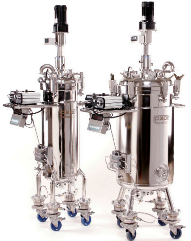
Portable Processing Systems complete with motors, support stands with casters, with mounted load-cells - consists of one 60 liter vessel 12" diameter with removeable head and 140 liter vessel with removeable head.