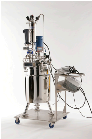
Portable Pressure Vessel Compounding System, made of stainless steel with a 30 Gallon (100 Liter) vessel with offset homogenizing assembly and variable speed stirrer assembly. Complete with a flanged bottom, load cells, tachometer, the unit sits on a stainless steel cart complete with casters, handle and brakes.

Compounding vessels to consist of 25 liter and 50 liter postable suspension vessels with mixing systems. Mounted on carts with pneumatic device to raise and lower removable heads.