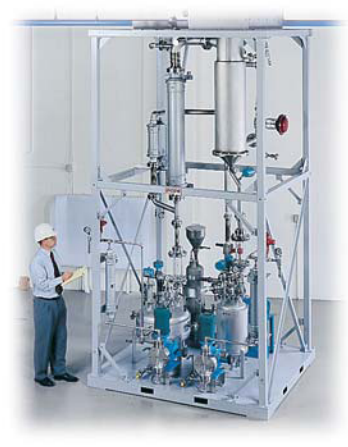
Turnkey, 12", stainless steel Wiped-Film Evaporator for polymer devolatilization

2", standard glass laboratory Molecular Still Unit