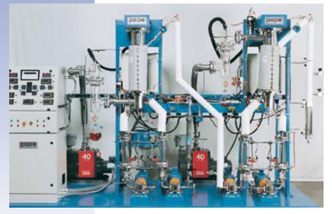
Turnkey, 6", two-stage Molecular Still Pilot Plant for long chain ester purification

Typical Continuous Mode Fractional Distillation System schematic