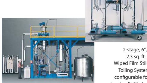
20", 25 sq.ft. Molecular Distillation Toll Processing Station