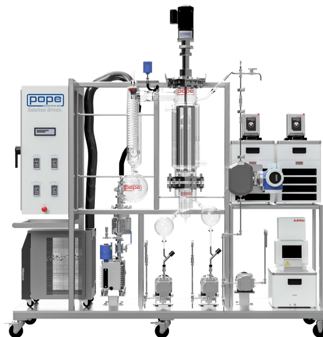
Unit pictured with available discharge pumps, flowmeter, external condenser and booster vacuum pump options

This turnkey package is a portable molecular (short path) still and evaporation system for high-performance pilot and production processing in a wide range of demanding applications. The CE Certification covers the overall system, not just individual components. Glass model provides throughputs up to 10 kg/hr, in optional SS, up to 25 kg/hr, application dependent. Backed by Pope's wealth of technical support and unparalleled customer care and service!