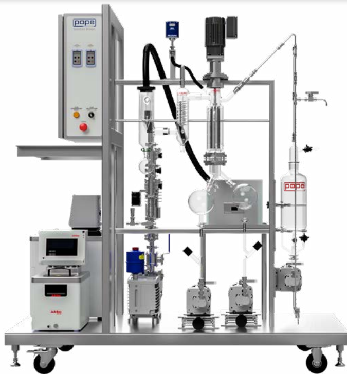
Unit pictured with available discharge pumps, flowmeter, external condenser and booster vacuum pump options

This turnkey package is a portable molecular (short path) still and evaporation system for high-performance pilot and production processing in a wide range of demanding applications. The CE Certification covers the overall system, not just individual components. Glass model provides throughputs up to 1 kg/hr, in optional SS, up to 2.5 kg/hr, application dependent. Backed by Pope's wealth of technical support and unparalleled customer care and service!